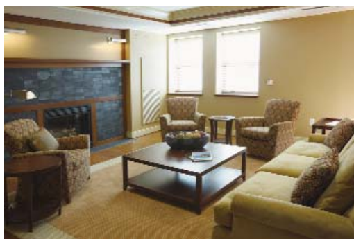
American Cancer Society AstraZeneca Hope Lodge, 51,000 sf is a home-away-from-home for cancer patients receiving treatment at area medical facilities.

Bond Brothers delivered three major projects this year, AstraZeneca Hope Lodge for American Cancer Society, and Ten Akron Street and Northwest Science Center for Harvard University.