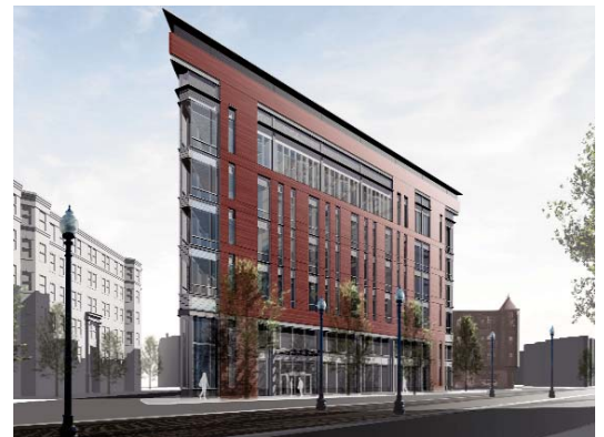
The Massachusetts College of Pharmacy and Health Sciences Griffin Academic Building. 50,000 sf ( Perkins+Will )