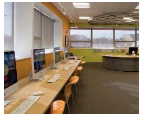
Educational Portal 175 No. Harvard Street ( Baker/Wohl Architects )