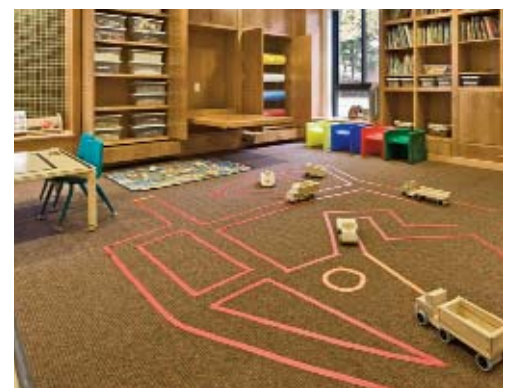
Soldiers Field Park Childrens Center Allston, MA ( DW Arthur & Associates )

Our Facilities Asset Management team is providing services to the Harvard Allston Development Group , developing Asset Management Program Requirements for all ADG projects. For Dana Farber Cancer Institute , a CMMS Data Quality and Work Process Review O&M Ready Program Development & Implementation.