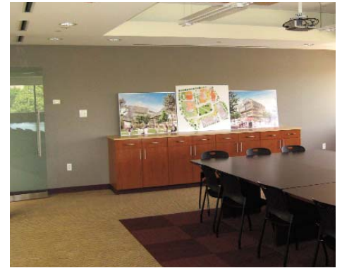
projects at Harvard University: Office fitout of 114 Western Avenue ( SEA Consultants )

Bond's Select Projects Group, which specializes in institutional and corporate fitout and building infrastructure projects, is hitting its stride with the following