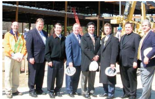
Stonehill College 80,000 sf Science Center.

We joined many of our clients in celebrating their topping off milestones this year: