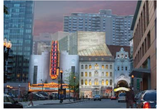
Emerson College Paramount Center. 187,000 sf ( Elkus Manfredi )