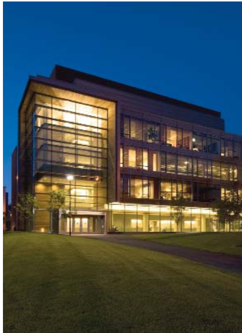
Harvard University Faculty of Arts & Sciences, 500,000 sf Northwest Science Center and Central Energy Plant.