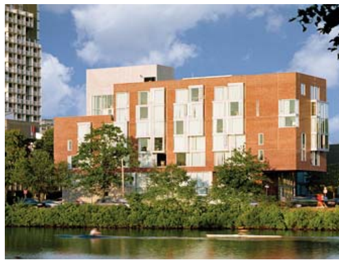
Harvard University Ten Akron Street Graduate Student Housing 180,000 sf with below grade parking. ( Kyu Sung Woo and Baker & Wohl )