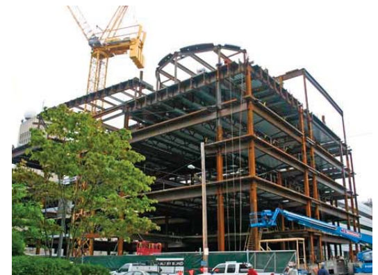
MIT Media Lab Expansion 163,000 sf ( Maki Associates with Leers Weinzapfel )