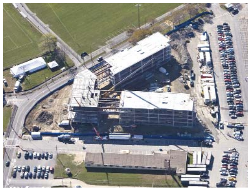
Roger Williams University , in Rhode Island, new residence hall 124,000 sf with 350 beds ( Perkins+Will )