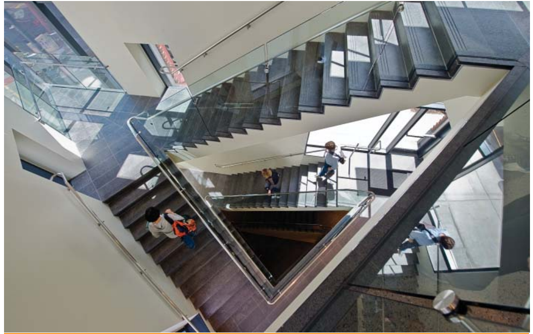
Massachusetts College of Pharmacy & Health Sciences, Griffin Academic Building

A long anticipated task was completed this past year, thanks to the Marketing Department and our consultant, Kor group. Rebranding efforts began back in 2008 with the hiring of an outside image consultant. For the next year Kor interviewed employees, business partners and clients to determine their impressions of our firm and how to translate these into a